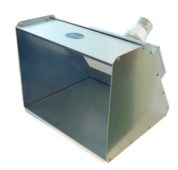
HSSB-22-16 Hobby or artist airbrush spray booth